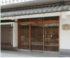
The exterior of the main store of Suetomi, a venerable Kyoto confectionery maker that cherishes the sense of season and the traditions of Kyoto-style sweets.