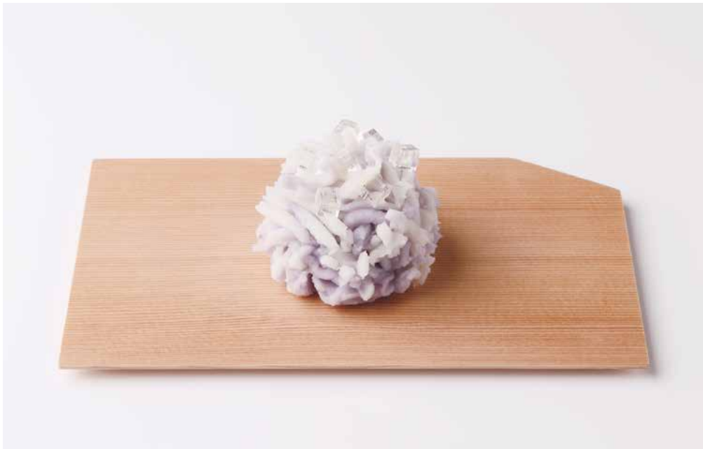
Ajisai (“Hydrangea”) made of sweet potato mash colored in refreshing color tone and decorated with agar drops that resemble sparkling rain.

In Kyoto, where the summer heat and humidity are particularly severe, a style of wagashi (Japanese confectionery) that conveys a sense of coolness has become a seasonal tradition. (Text: Morohashi Kumiko)