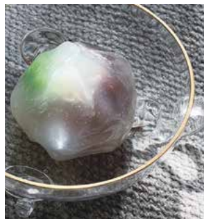
Natsukodachi (lit. “a grove of trees growing in summer”), a summer-themed sweet made with kuzu agar that reflects the lush green vitality of trees.

“ Kyo-gashi do not only taste delicious,” says