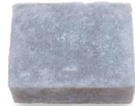
Kuzu yaki (baked kuzu sweets). The use of kuzu agar evokes a cooling sensation.

paste, which represents the lush vitality of tree leaves. The paste is further wrapped in jelly-like kuzu agar 4 , creating the image of sunlight streaming through the trees and a gentle wind. The act of slowly savoring the sweet invokes the sensation of strolling through a verdant forest under a cooling wind."