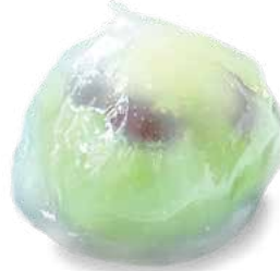
Sawabe no Hotaru (lit. "Fireflies near a water stream"). The jade-colored bean jam resembles a water plant, while the black azuki beans are made to look like fireflies.